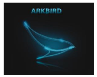
Mini Gimbal Camera